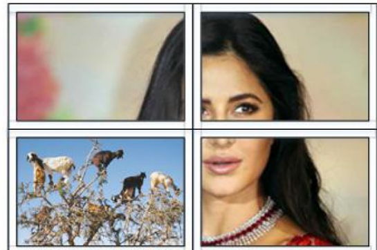
Video Wall display with bezel compensation and different full frame image on display 3